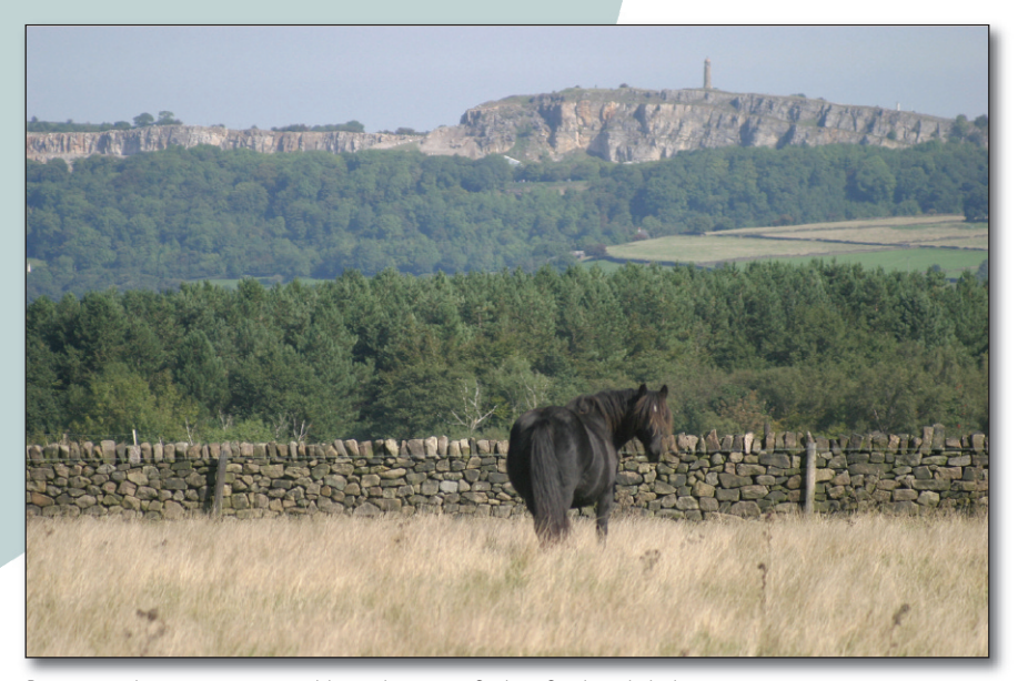
Ponies on the moor can travel long distances finding food and shelter.