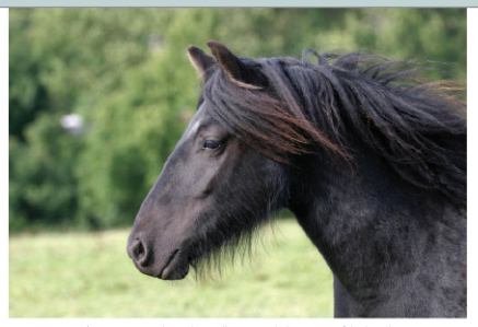
This young pony shows the intelligence and alert nature of the breed.