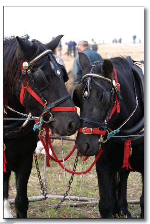
Autumn sees the Ploughing Match season. Countrylane Gemma and Countrylane Beauty competed in numerous Ploughing Matches during the early 2000s.