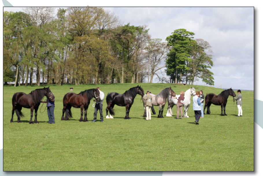
A full range of colours line up in the gelding class.