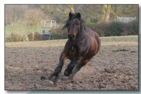
Spring is in the air and even this uneven terrain doesn't stop the fun.