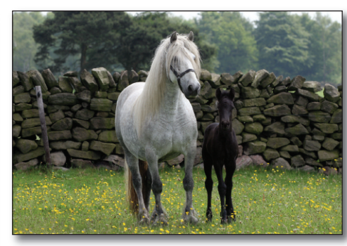
Mare and foal. Ponies keep a watchful eye out for anything interesting.